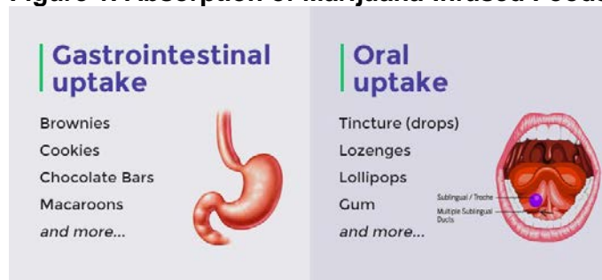
Figure 1. Absorption of Marijuana-Infused Foods